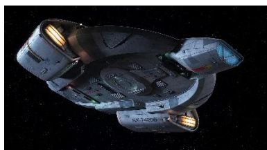
6: Star Trek Deep Space 9