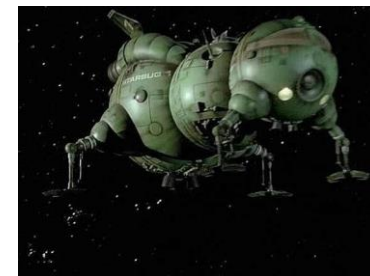
5: Red Dwarf