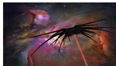
9: Babylon 5