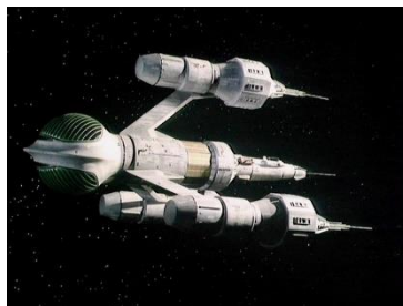
3: Blake's 7