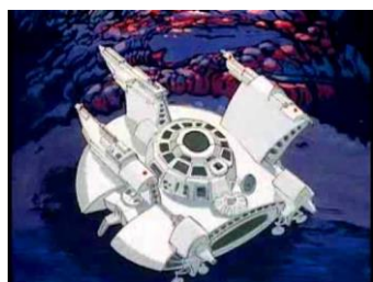
11: Space Sentinels