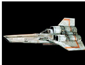
4: Battlestar Galactica