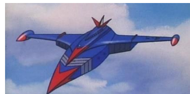
14: Battle of the Planets