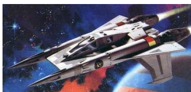
18: Buck Rogers