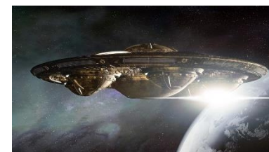
10: Doctor Who