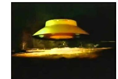
20: The Invaders