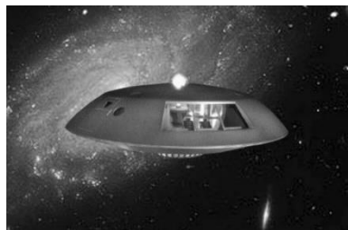
2: Lost in Space